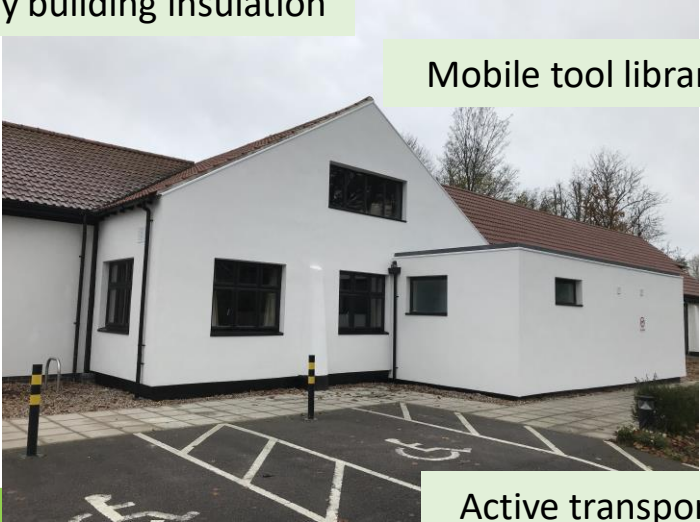
Mobile tool libraries