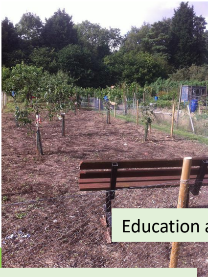
Orchard and allotments